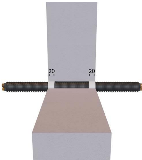
Figure A.1.3: Seal of a corrugated pipe with cables in a rigid wall.