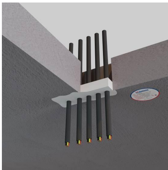
Figure A.1.5: Seal of a cables in a rigid floor.