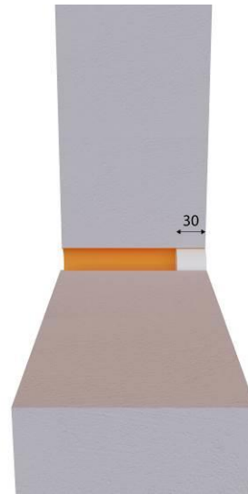
Figure A.1.2: Seal of a PVC pipe in a rigid wall.