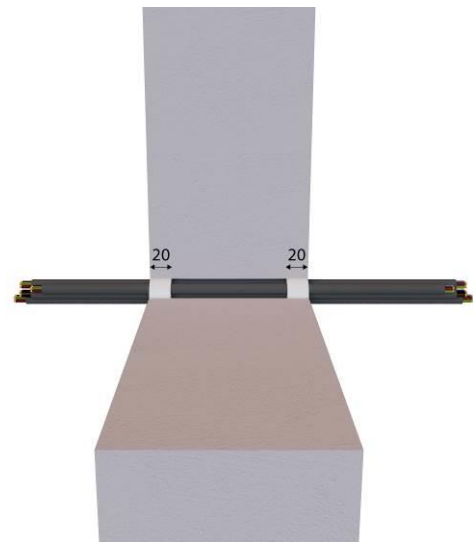
Figure A.1.4: Seal of a bunch of cables in a rigid wall.